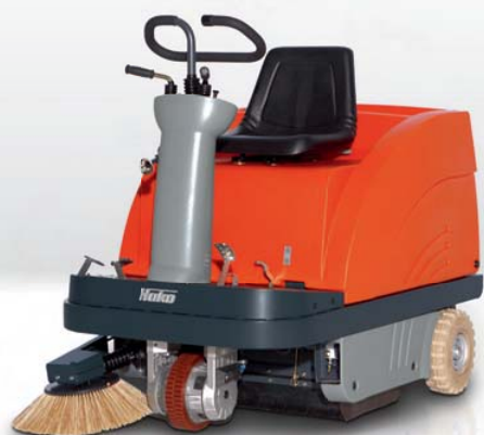
Hako-Jonas 900 E