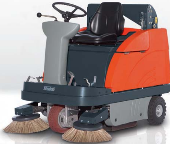
Hako-Jonas 980 EH