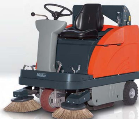
Hako-Jonas 980 EH